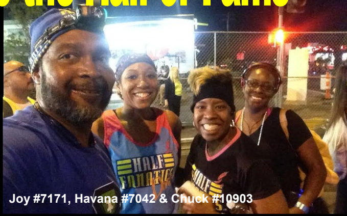
Joy #7171, Havana #7042 & Chuck #10903