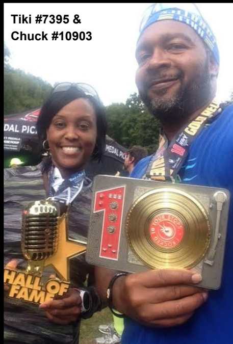
Tiki #7395 & Chuck #10903