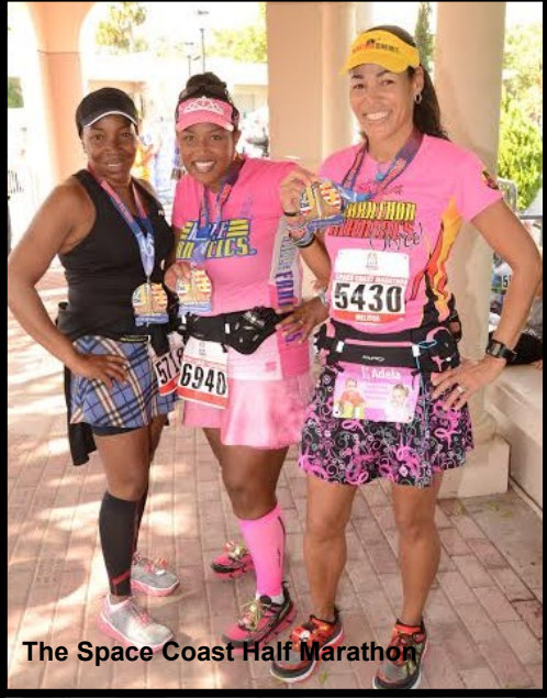
The Space Coast Half Marathon