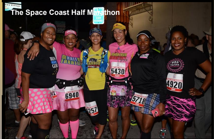
The Space Coast Half Marathon